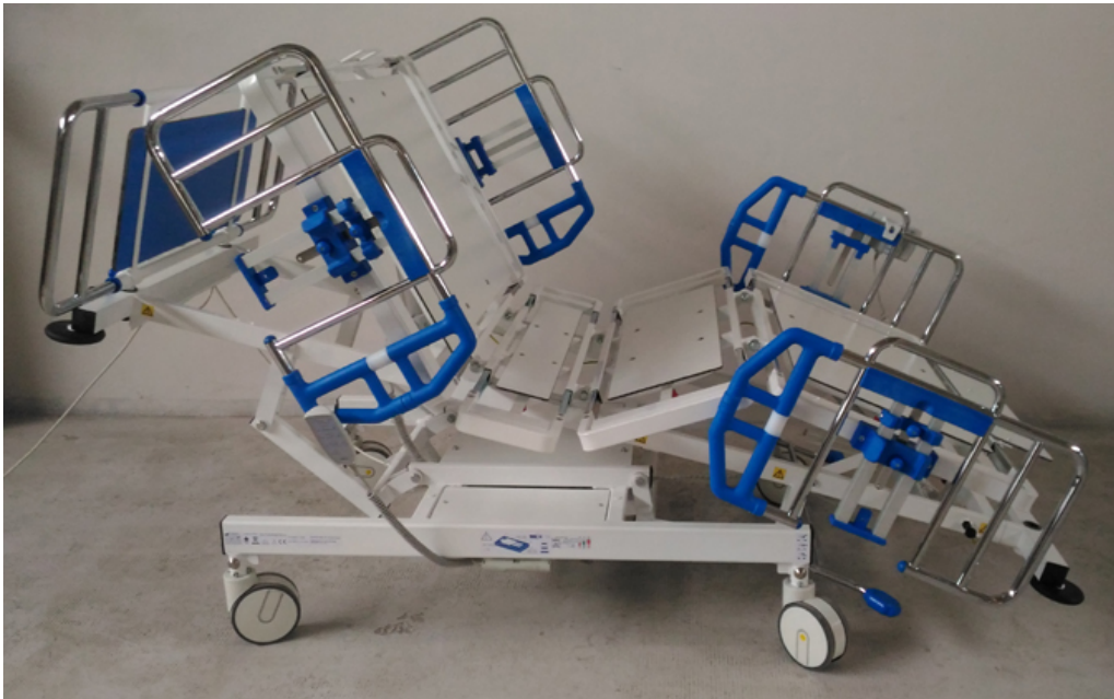
<backrest, legrest, height 39-75cm (43-79cm with integrated scale), cardiac chair>