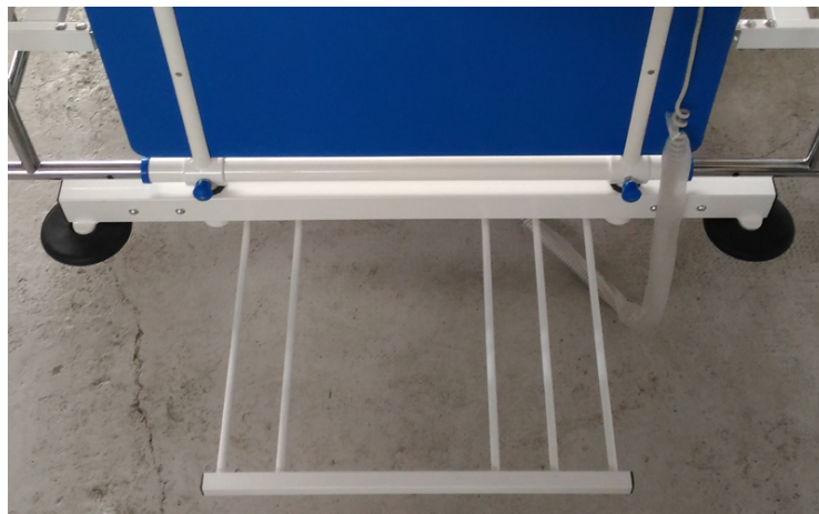
<blanket tray >