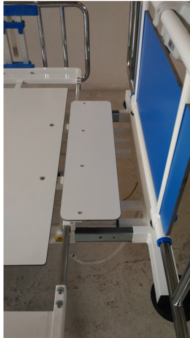
<integrated foot extension from 200cm to 220cm >