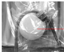
C. Hand pump