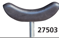
Quality leg holders