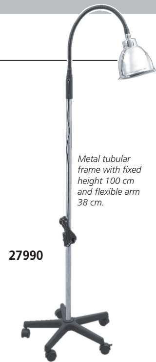
Metal tubular frame with fixed height 100 cm and flexible arm 38 cm.

• 27990 STUDIO LIGHT Metal tubular frame with plastic base Ø 60 cm with 5 plastic wheels.