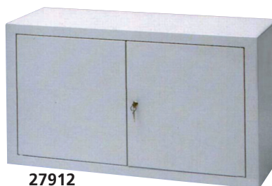
Hanging cabinet with 2 lockable doors. Inside division in 2 compartments left side with 2 removable shelves, right side with 1 removable shelf.