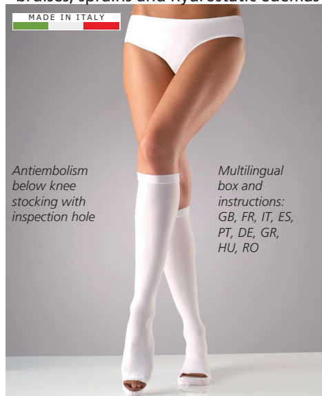
BELOW KNEE - pair