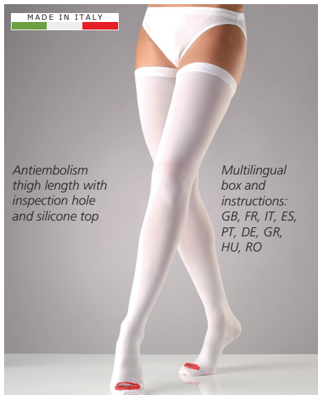
THIGH LENGTH - pair