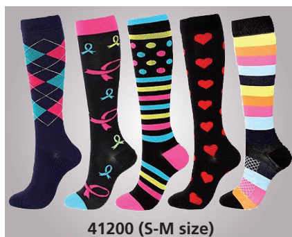
41200 (S-M size)