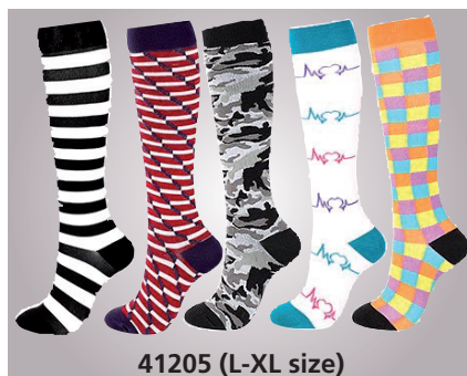
41205 (L-XL size)