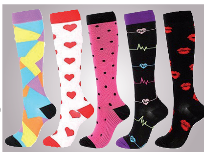
41201 (S-M size)