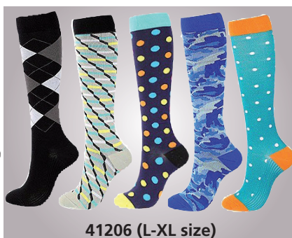
41206 (L-XL size)

Multilingual instructions: GB, FR, IT, ES, PT, DE, PL, SE, GR