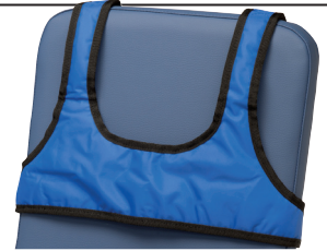
• 43217 HARNESS