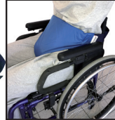
• 43176 ABDOMINAL BELT