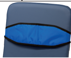
• 43216 ABDOMINAL BELT

Padded harness and belt to prevent patient sitting on wheelchair from sliding forward. Equipped with two black propylene webbing (height 5 cm), adjustable up to 100 cm. One-hand release safety clip closure. Harness has two adjustable suspenders with sturdy strap. Class I, Medical Device. Washable at 30°. Harness size: 60xh 37 cm, max. adjustable length: 260 cm. Belt size: 48xh 15 cm, max. adjustable length: 248 cm.