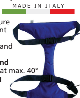
• 43175 PELVIC BELT