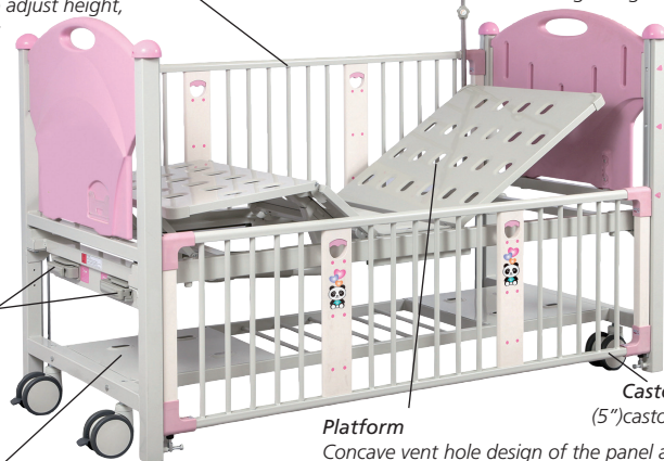
Castors Ø 12.7 cm (5") castors with brakes

IV Pole Stainless steel IV pole, bearing 15 kg