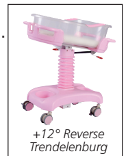
+12° Reverse Trendelenburg