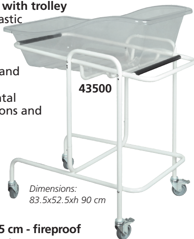
Dimensions: 83.5x52.5xh 90 cm