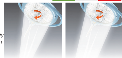
Light field adjustment for PENTALED 28