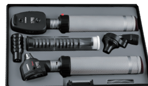
F.O. Xenon oto/ophthalmo set 3.5 V 31538

F.O. otoscope head, F.O. ophthalmalmo head, battery handle with bayonet lock and plug-in, 1 set of 5 reusable eartips (2.5, 3.0, 4.0, 5.0 & 10.0 mm), tube of 14 disposable eartips (2.5 & 4.0 mm), spare oto and ophthalmalmo bulbs, rechargeable Li-ion battery 31547, in a rigid case.