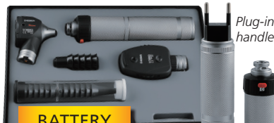
F.O. Xenon oto/ophthalmo plug-in set 3.5 V 31537

31536 F.O. ophthalmalmo head, battery handle with bayonet lock, spare bulb, in a rigid case.