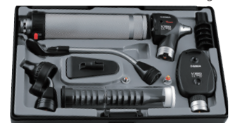
F.O. Xenon ENT diagnostic set 3.5 V 31539

F.O. otoscope head, F.O. ophthalmalmo head, 2 battery handles with bayonet lock, nasal illuminator with F.O. light, 1 set of 5 reusable eartips (2.5, 3.0, 4.0, 5.0 & 10.0 mm), tube of 14 disposable eartips (2.5 & 4.0 mm), spare oto bulb, suitable also for nasal illuminator, and ophthalmalmo bulb, in a rigid case.