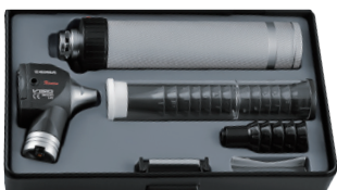
F.O. Xenon otoscope set 3.5 V 31535

F.O. otoscope head, battery handle with bayonet lock, 1 set of 5 reusable eartips (2.5, 3.0, 4.0, 5.0 & 10.0 mm), tube of 14 disposable eartips (2.5 & 4.0 mm), spare bulb, in a rigid case.