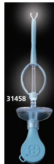
Lighted forceps for foreign body removal with LED illuminator