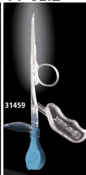
Lighted ear curette 3 mm tip with LED illuminator

Ear curette tip has a 90° range of motion. It articulates to assist in removal of cerumen from the ear canal