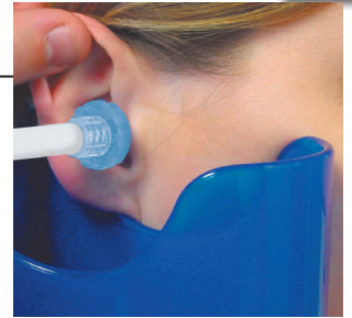
Improved patient comfort thanks to the soft "gentle touch" design