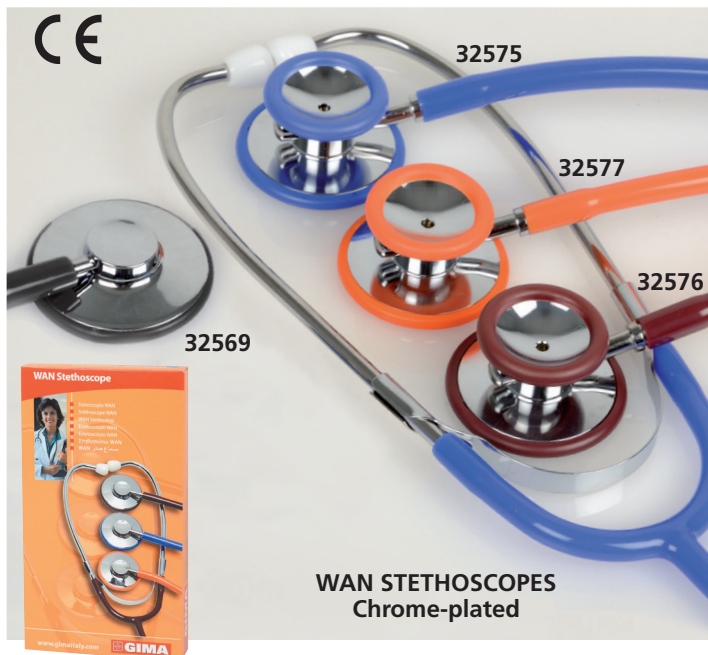
WAN STETHOSCOPES Chrome-plated