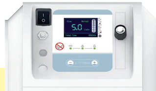
Oxygen concentrator control panel