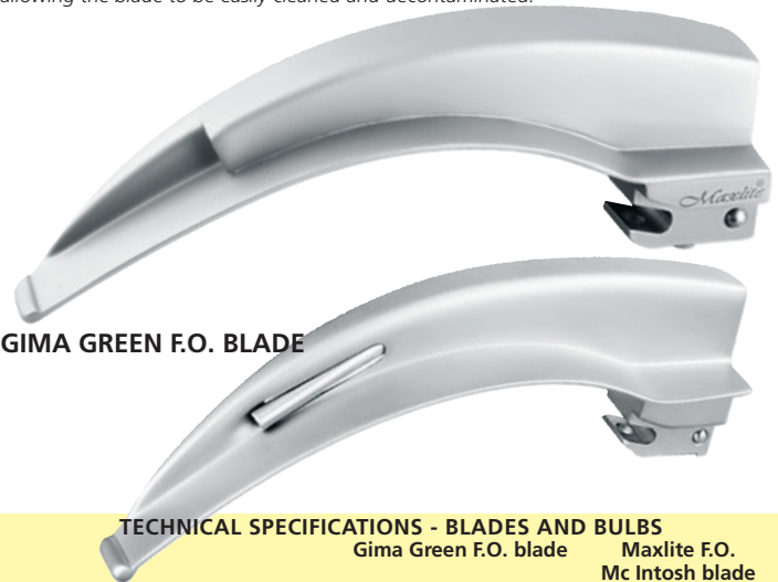
GIMA GREEN F.O. BLADE

Built with an integrated F.O. bundle with no cavities to trap dirt or body fluids, this allowing the blade to be easily cleaned and decontaminated.