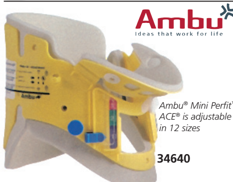
Ambu® Mini Perfit™ ACE® is adjustable in 12 sizes