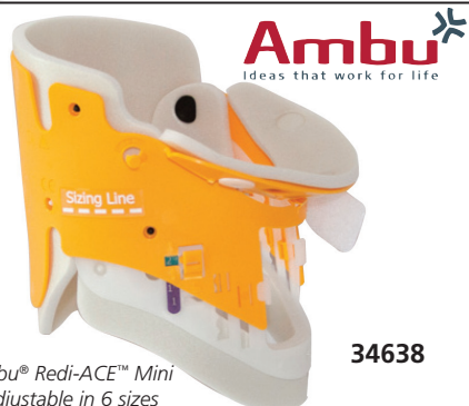
Ambu® REDI-ACE™ Mini is adjustable in 6 sizes