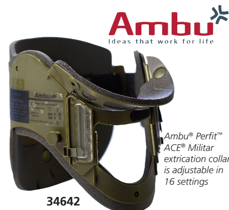
Ambu® Perfit™ ACE® Militar extrication collar is adjustable in 16 settings

Designed to assist with the maintenance of neutral alignment, prevention of lateral sway and anterior-posterior flexion and extension of the cervical spine during transport.