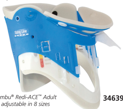
Ambu® REDI-ACE™ Adult is adjustable in 8 sizes