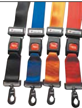
33847 set of 4