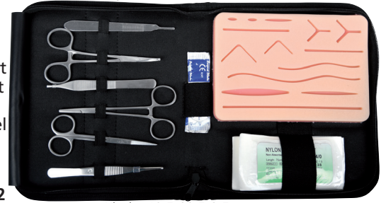
Kit size 19.5x22.5x3.5 cm

• 23022 SUTURE TRAINING KIT Suture training kit includes: silicone pad (23020), 6 tools and 4 blades made of stainless steel, 8 sutures and a black PVC leather case. Intended for teaching and training only, not for human or vet use. Multilingual label and manual: GB, FR, IT, ES, PT, DE, SE, DK, GR, RO.