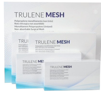
Multilingual manual and box: GB, FR, IT, ES, PT, DE, GR.

TRULENE (Polypropylene) MESH - Non-Absorbable