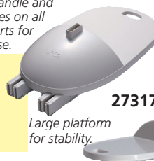
Large platform for stability.

Measuring range: 20-205 cm Graduation: 1 mm Size (open): 337x590xh 2,130 mm Size (folded): 337x177x624 mm Weight: 2.4 kg