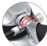
Left and Right hand use