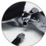
Male and Female connector