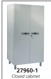
27960-1 Closed cabinet

4 powder-coated steel feet at the base with adjustable plastic insoles. Size: 910x600xh 1980 mm