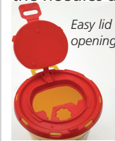
Easy lid opening

Temporary and permanent closures with a wide opening for the disposal of larger materials, and three indents for the needles and insulin pen removal.