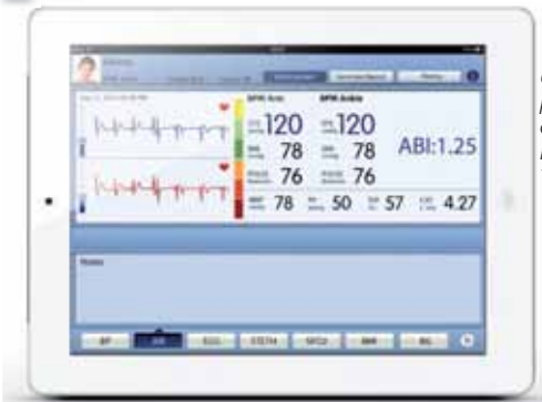
Cardiolab includes 2 pressure cuffs, USB cable and manual (GB, IT, FR, DE, ES, NL). Tablet not included.